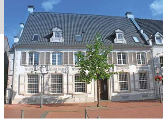
AUMUND Family Office "Weißer Rabe" - Head Office of the Foundation

On 29th May 2019 the Aumund Foundation was recognised by the Düsseldorf Regional Government as an independent spend-down charitable foundation under civil law. This laid the groundwork for the significant expansion of foundation activities, because the Aumund Foundation will support projects not only in the areas of science and education, but also health projects all over the world. The combination of ensuring the physical wellbeing of children and young people with subsequent educational support is the coherent holistic approach taken.