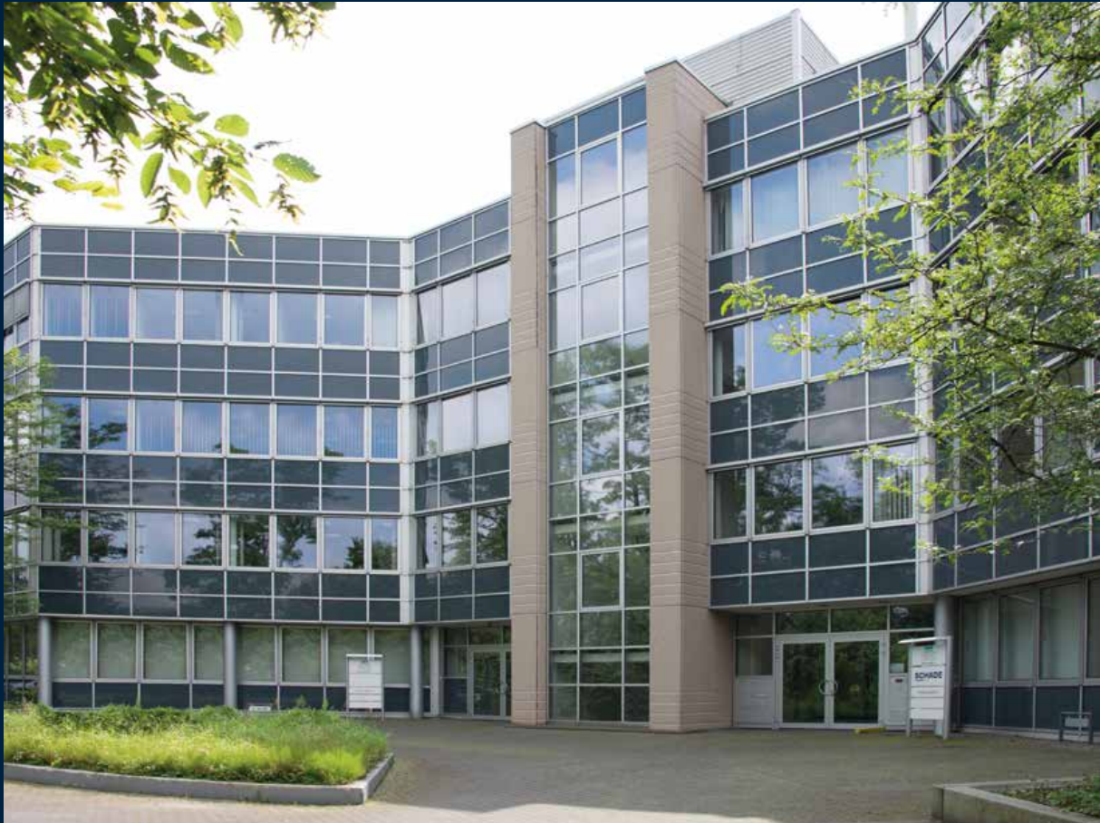
SCHADE Headquarters Gelsenkirchen, Germany