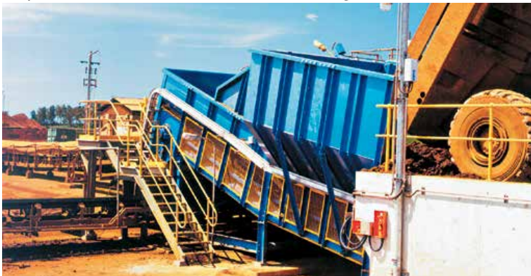
Samson® Feeder for red mud